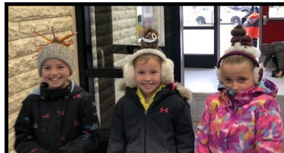
CRAZY HAIR DAY