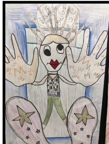
Learning about FORESHORTENING